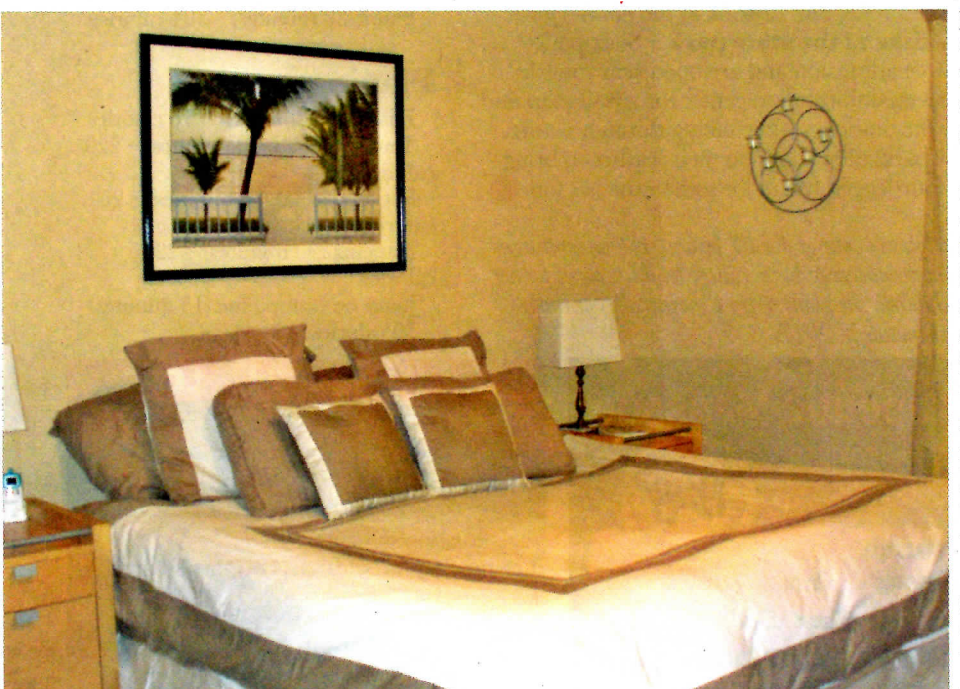
A master bedroom needs to be specially decorated to enhance a person's ability to relax and get a good night's sleep in the room. The effects of sleeping well can outweigh the costs of making a few needed changes that lead to a more calming, sleep-friendly atmosphere.

It is easy to ignore the importance of the room where you sleep in your home. Women in particular are very visual and do not do well in cluttered rooms, with toys left from the kids, papers, bills or miscellaneous items left on beds or sitting areas. Do yourself a favor: stand at the door of your master bedroom and ask yourself what you feel when you look into the room? If you feel anxious or overwhelmed, then we have some work to do.